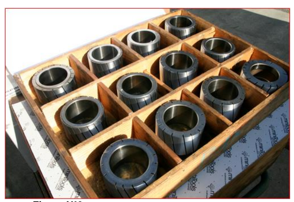
Figure N°3- Maximum care in packaging and transportation

Building the crushing roller with steel S390 and coating with ALTICROME, it was found that the lifetime of the roller doubled to equal conditions of use.